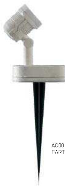
AC001 EARTH SPIKE ON REQUEST