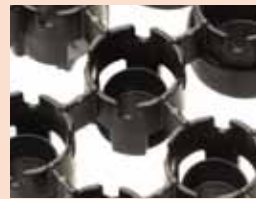
Open cell structure promotes optimum grass growth

Tensar & TriAx™ are registered trademarks of Tensar International