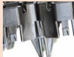
Integral interlocking 'snap-fit' connections on 500mm x 500mm grids