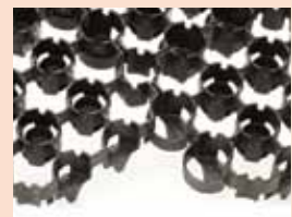
Pavers can be offset by one cell increments for curves obstructions