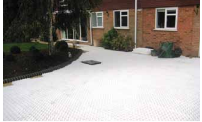
BODPAVE 85 natural (white) pavers installed for a domestic driveway application