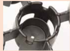
Cells contain water retention cups to optimise root growth