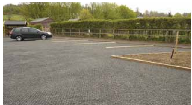
BODPAVE 85 installation for a gravel car park