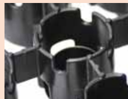
Castellations aid lateral grass growth and increase traction