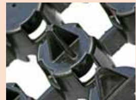
Integral ground spikes resist deformation & lateral movement