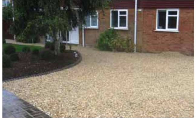
Filled with angular gravel creating an attractive reinforced permeable surface that retains the gravel