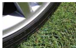
Mesh after installation