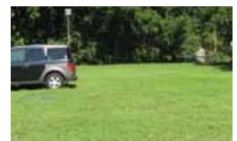
After installation - grass grows through quickly