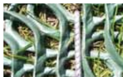
Secured with U-pins