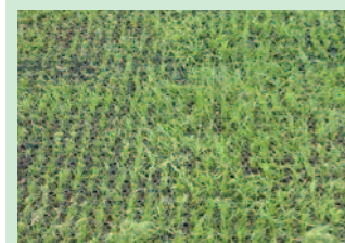
Allow the grass to grow through the mesh apertures.