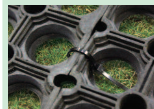
Connect matting together with cable ties.