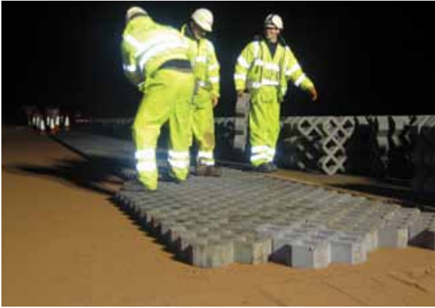
TRUCKPAVE 80 weighs only 9kg and is easy to handle and install