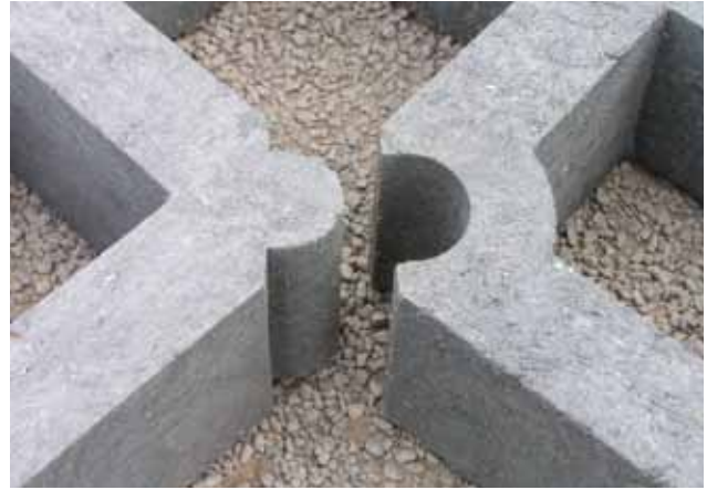
TRUCKPAVE 80 interlocks with adjacent pavers