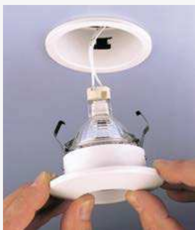
EASY RELAMPING AND MAINTENANCE