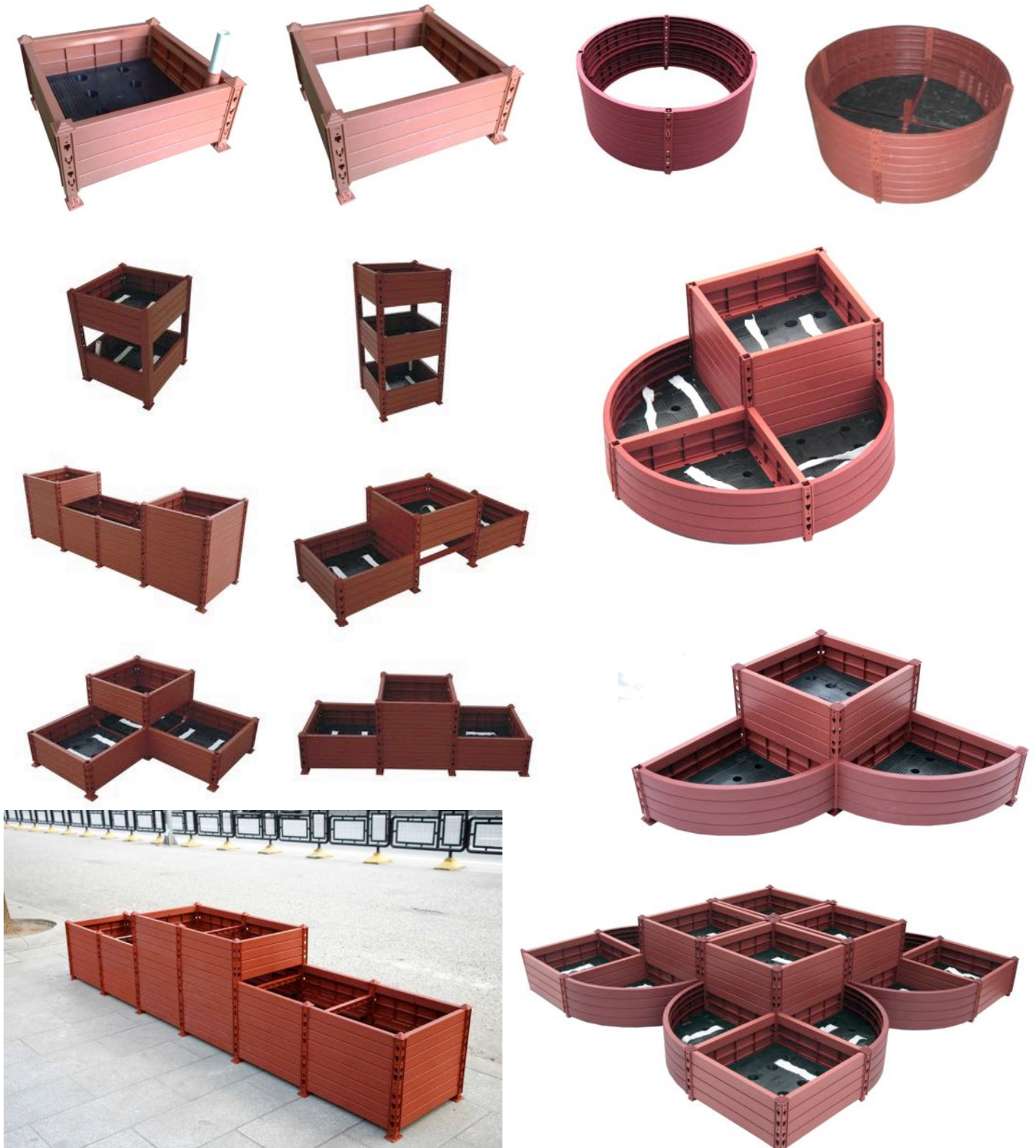
Modular Self watering Planters

Our Modular planters comprises of base self watering planters with various frame types and shapes, which can be used in combination to build different style landscaping. This series planters are also widely used in roads, parks, squares, streets, pulic areas, shopping centres and so on. They are self-watering planters, convenient to use and grow plants and maintenance friendly