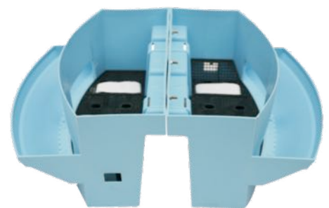
Saddle Form Planters